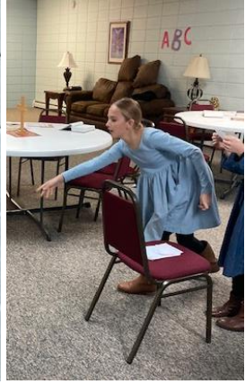
Fun at Sunday School