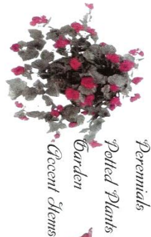
Potted Plants Garden Accent Stems Perennials